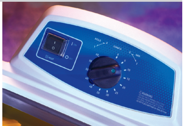
Bransonic M Series